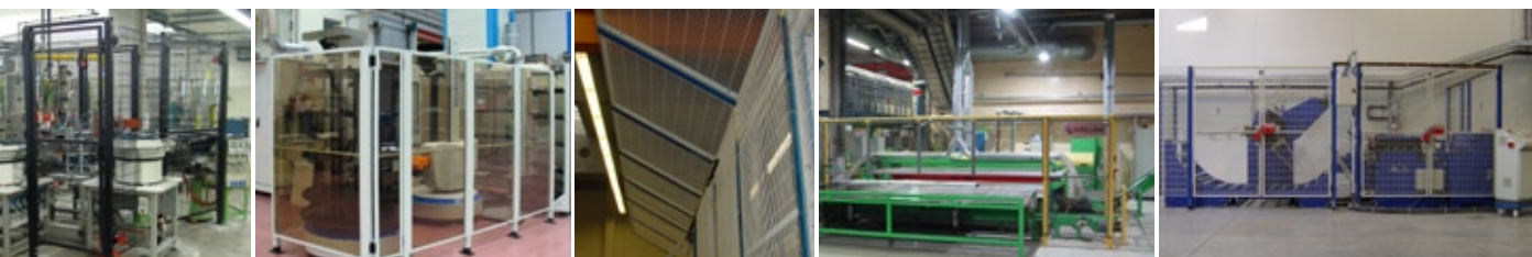
Easy to adapt the width of the panels