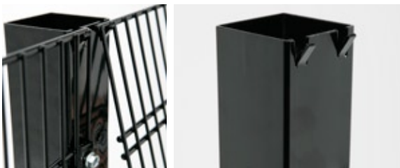
Easy to hang the mesh on the specially designed upright

System height: 2100mm. Panel height: 1920mm. Panel width: 500, 1000, 1200 and 1500mm. Mesh screens: 100mm x 20mm, wire gauge - 3mm vertically and 5mm horizontally. A special upright is available for combination with Arion Pro-Tect's other systems.